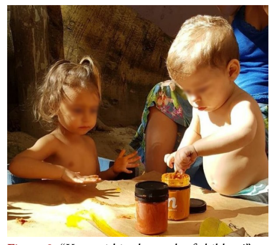
Figure 2. "Keep within the reach of children!"