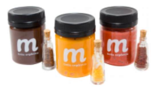
Figure 1. Mancha Orgânica paint kit.